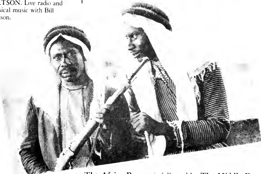
The Africa Report is followed by The Middle East Report, Thursdays at 8:30 p.m.